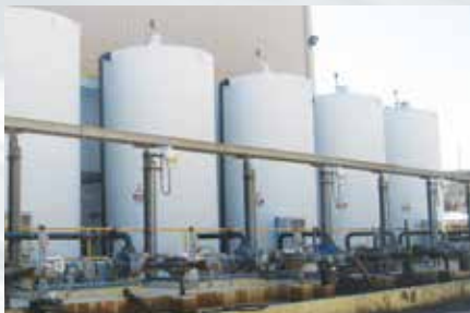
Bulk storage tanks