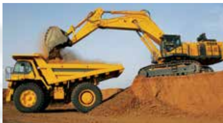
Mining and construction equipment