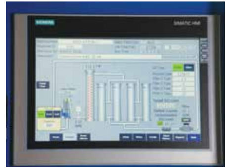
Filtration monitoring (above) and filtration system (below left)

We don't choose just anybody and neither should you. You can be assured of receiving quality ISOCLEAN Services provided by dedicated professionals.