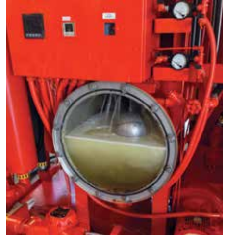
Vacuum dehydrator used to remove water contamination.