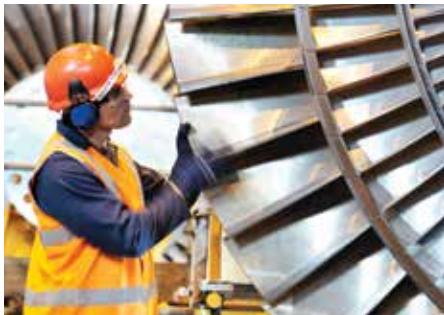
Industrial turbine systems