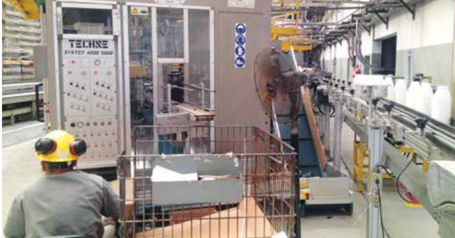
Plastic injection molding