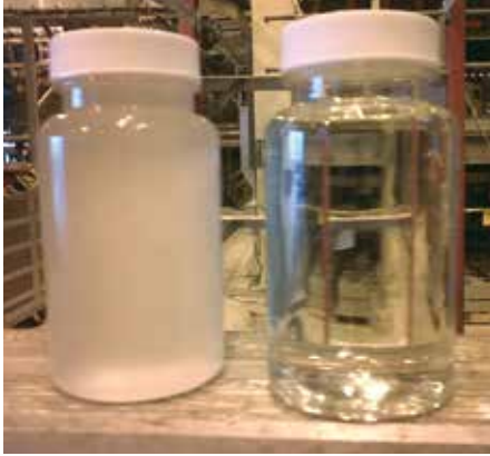
The left beaker pictured is actual hydraulic oil with high levels of moisture and particle contamination at ISO-Cleanliness code 22/21/20. The right beaker shows the same sample after the contaminants were removed at the new ISO-Cleanliness code 18/16/13.