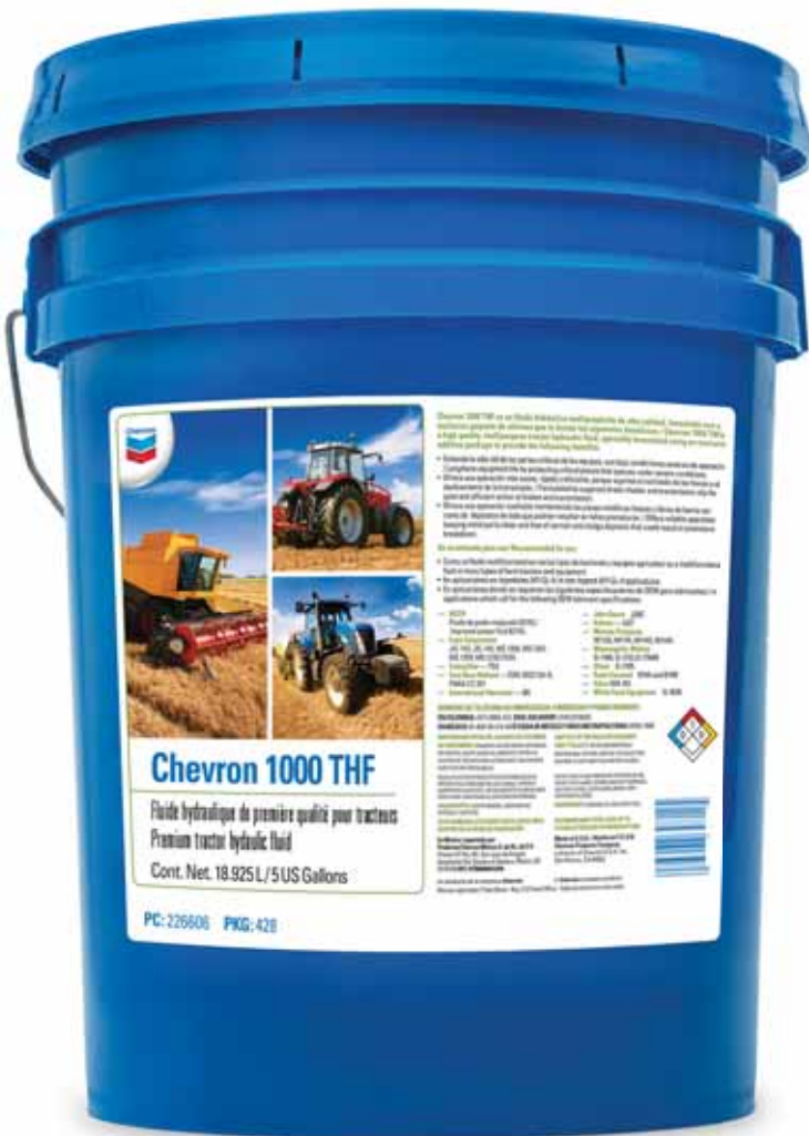
Pail label image for illustration only

Chevron 1000 THF is a high quality, multifunctional tractor hydraulic fluid, specially formulated for use in transmissions, final drives, wet brakes and hydraulic systems of tractors and other equipment employing a common fluid reservoir.